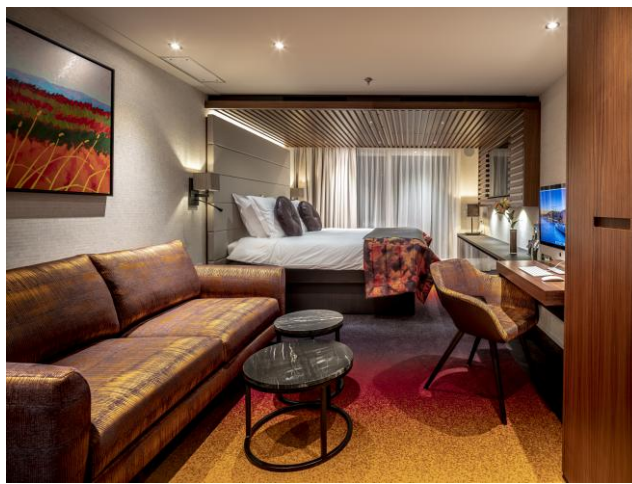
Suite SA – 32 sqm – outside balcony