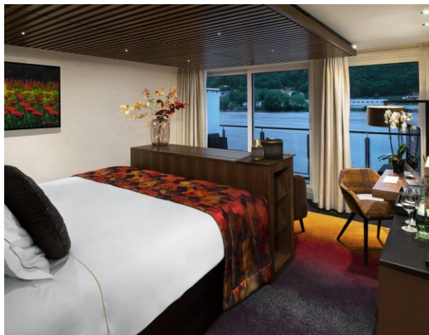
Suite GS - 44 sqm – outside balcony