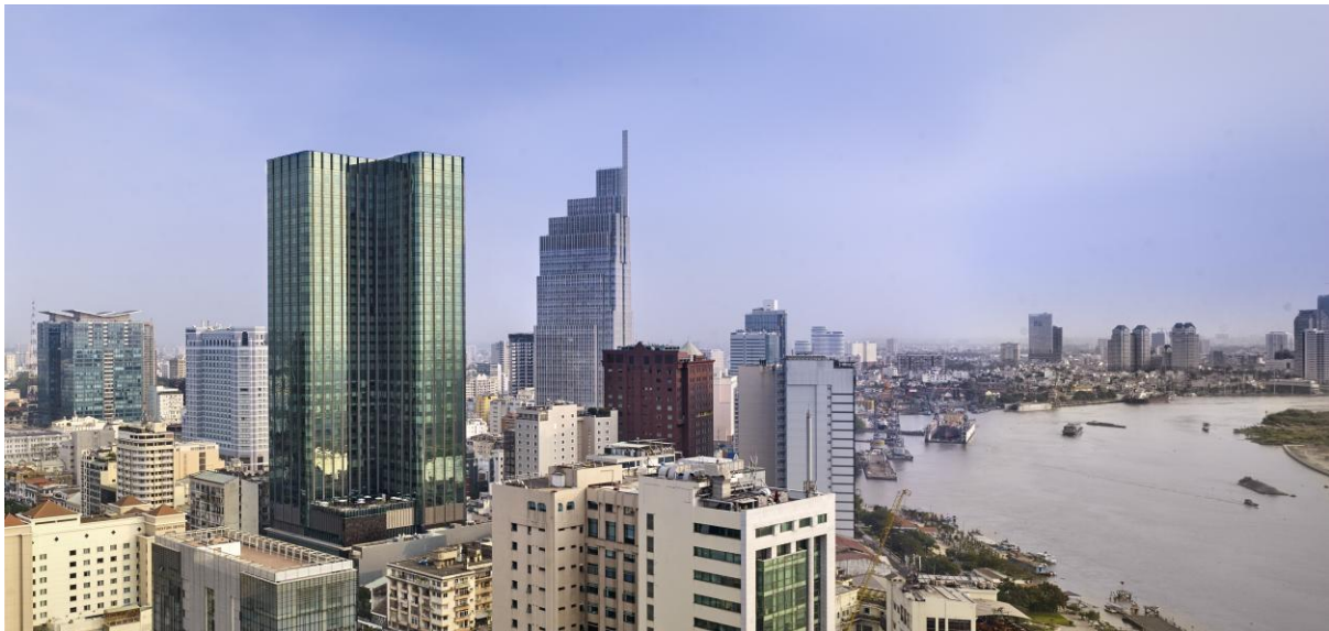
The Reverie Hotel is the green glass building