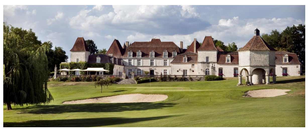
Day 10 – Thursday 22 August 2019 – Uniworld Cruise – Golf – Chateau des Vigiers

After an early start, we will drive 50 minutes and play the stunning Château des Vigiers golf course . Designed by Donald Steel, the 27 hole course layout was built in 1992. Each nine starts and finishes at the namesake chateau (refer photo). We will return via St Emilion and allow time for a stop and look around the historic cobblestone township. Our ship will over-night in Libourne.